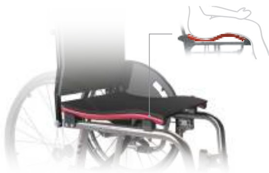
▲ Self propel

The Ergo 115 is packed full of innovative features that you would expect from a Karma wheelchair including; slowing brakes, quick release wheels, detachable upholstery and the patented Ergo seating.