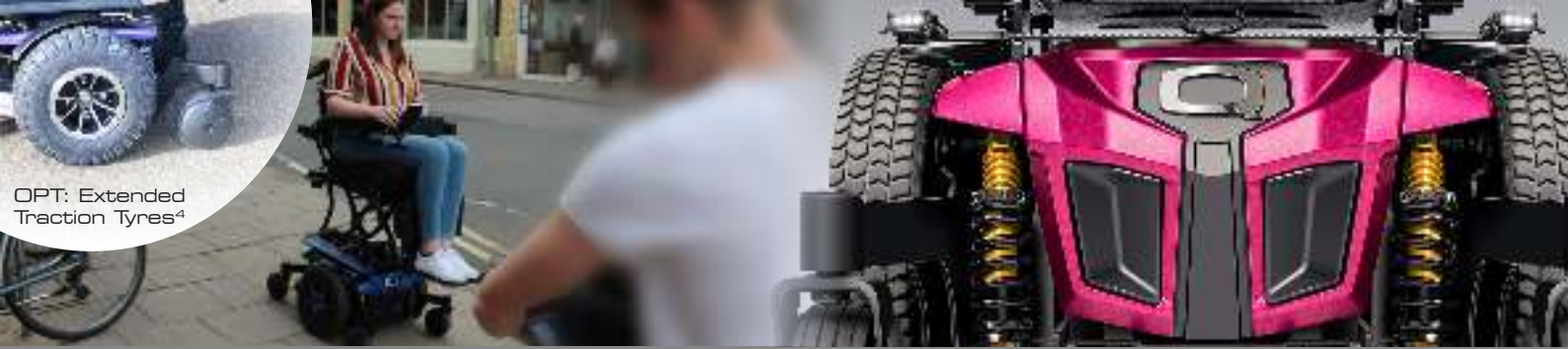
OPT: Extended Traction Tyres 4