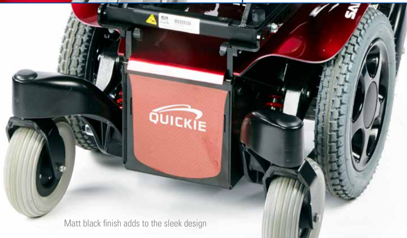
Matt black finish adds to the sleek design