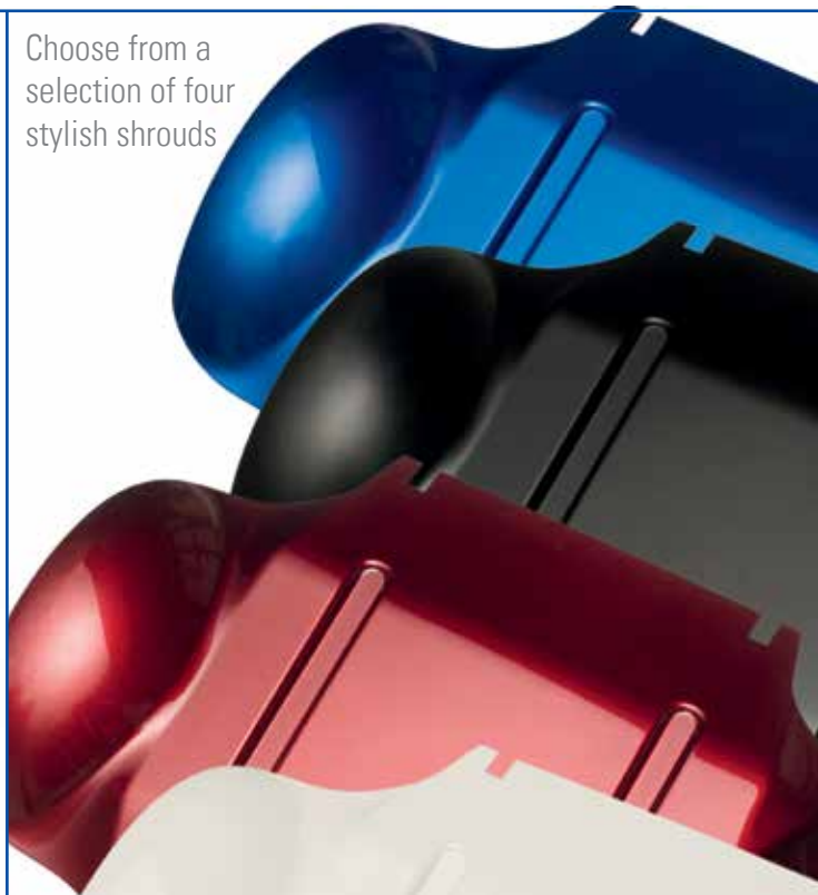
Choose from a selection of four stylish shrouds